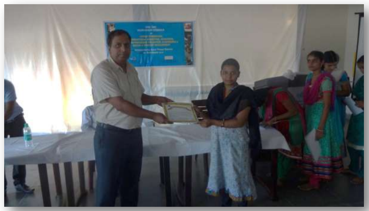
Distribution of Participation Certificate