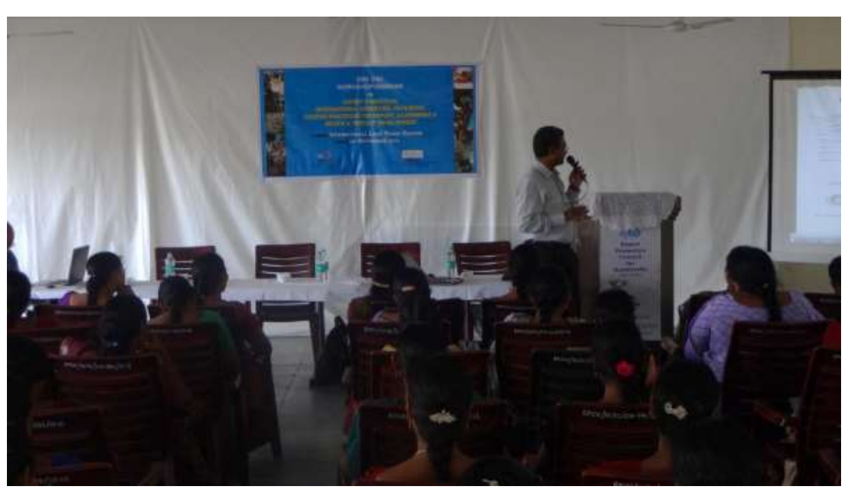
Seminar in progress